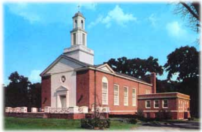
WESTMINSTER PRESBYTERIAN CHURCH Elizabeth New Jersey

Kitami and Elizabeth have maintained their international friendship since then.